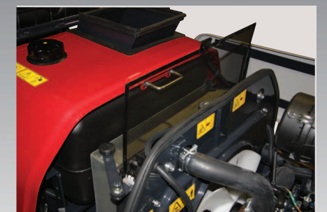
Easily cleaning of the screen for dust-free sucking up of cooling air.