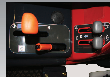
Cruise Control for variable speed setting is included as standard. Two levers for heffen en openen of the collector.