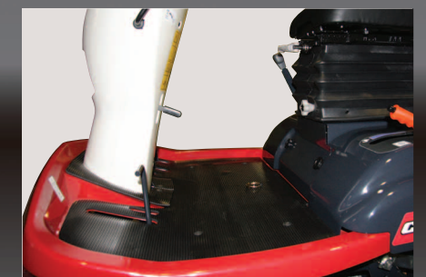
The spacious operator platform provides plenty of foot and leg.