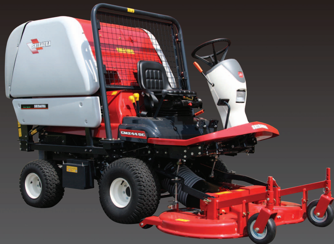
Well-organized dash board: