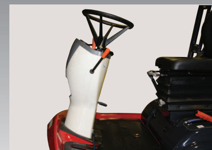
Steering column can be tilted and power steering is standard equipment.