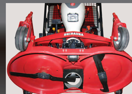
Mower deck can be flipped up to maintain blade and clean inside deck easily. Excellent cut quality is achieved by a PTO driven 2-blade, which in turn against each other, mowerdeck.