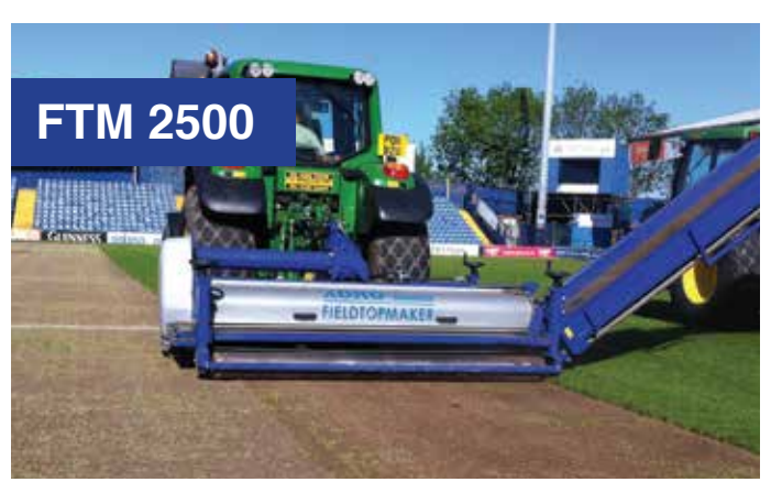
A model to suit any size tractor 35hp +