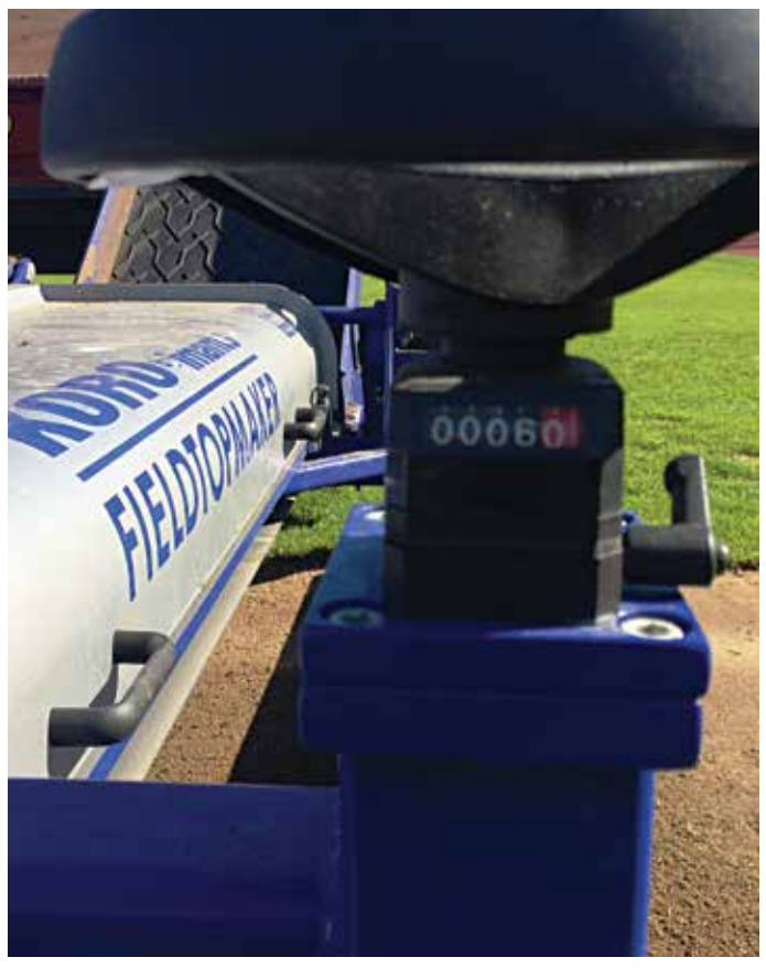
Depth setting is accurate to 0.1mm, via a digital display read out