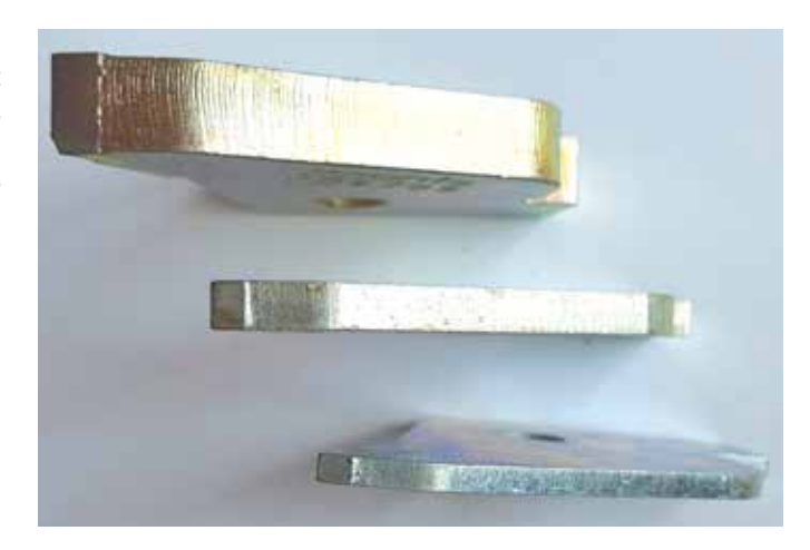
10mm, 5mm and 3mm blades

All 3 blades can be used on natural turf, on both cool and warm season grasses for Koro Universe® Finesse Mowing, or Koro Universe® Fraze Mowing.